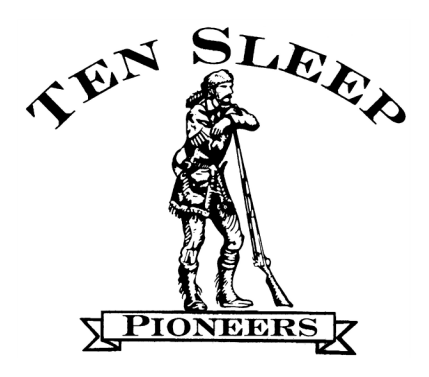
Ten Sleep School Supporting Success