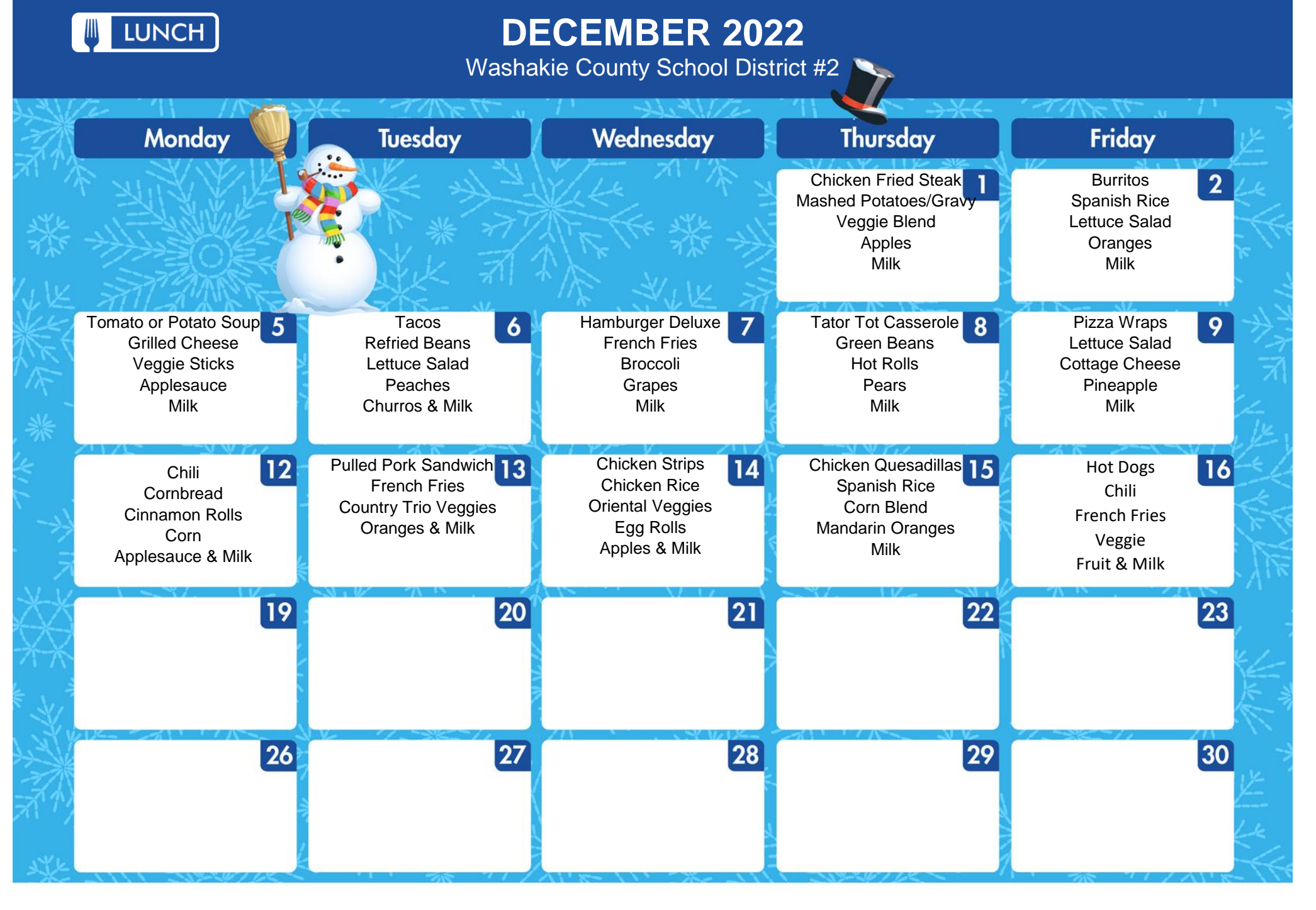
This Institution is an Equal Opportunity Employer